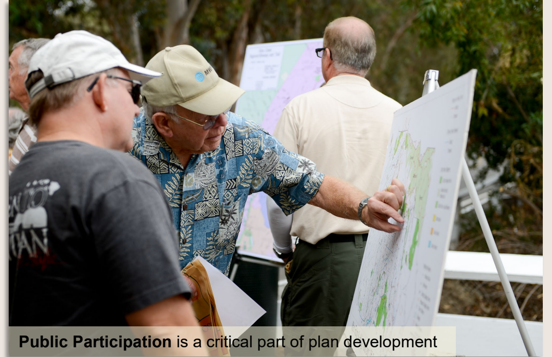
Public Participation is a critical part of plan development