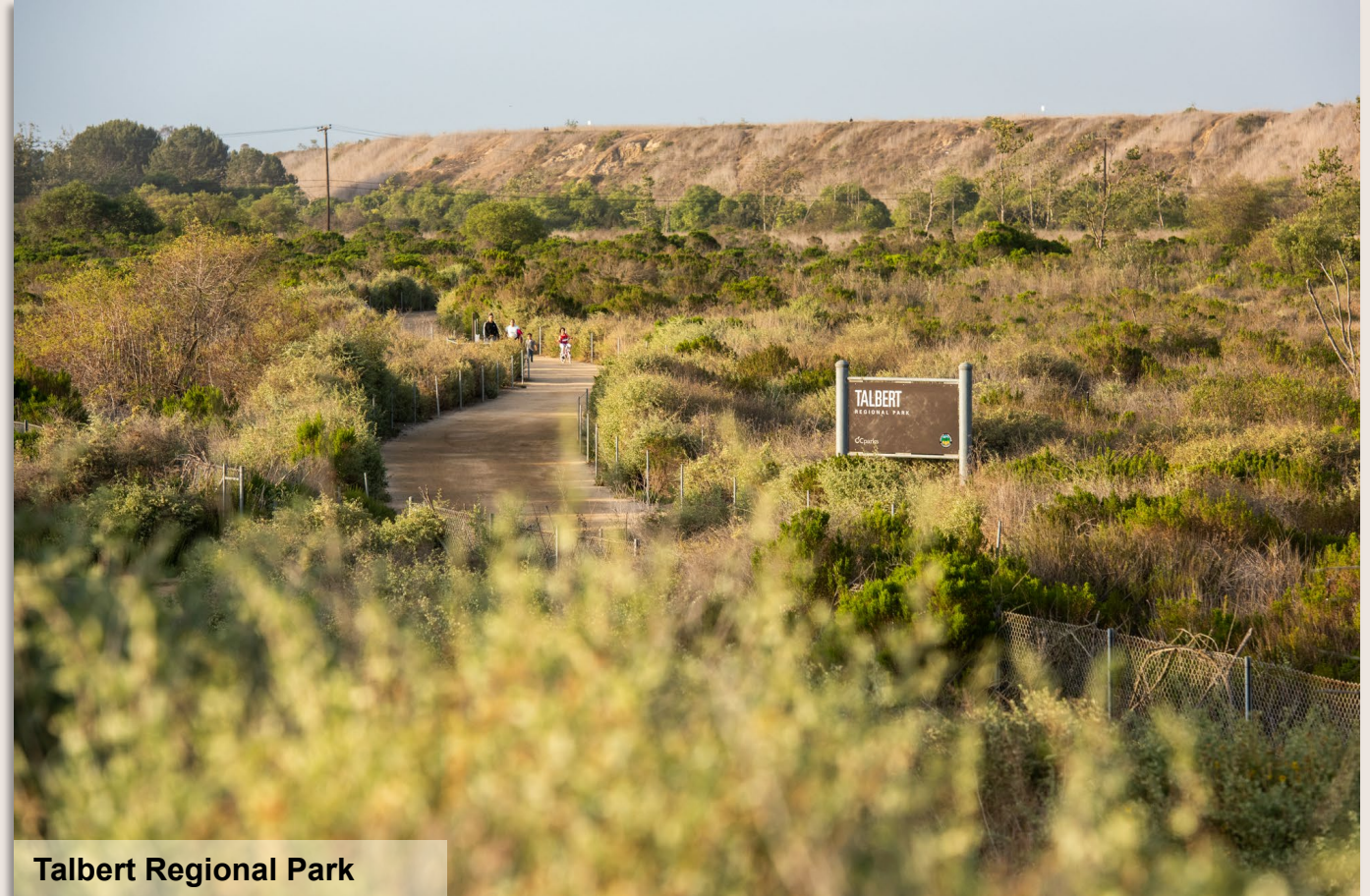
Talbert Regional Park