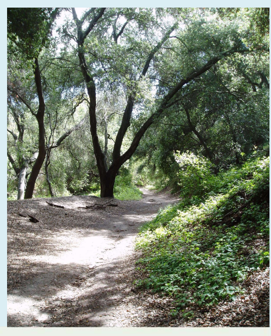
Oak Woodlands are one of the protected native habitat types in the NCCP/HCP, Whiting Ranch Wilderness Park