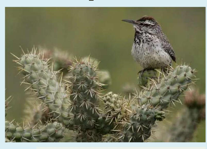
Coastal Cactus Wrens are a target conservation species in the NCCP/HCP