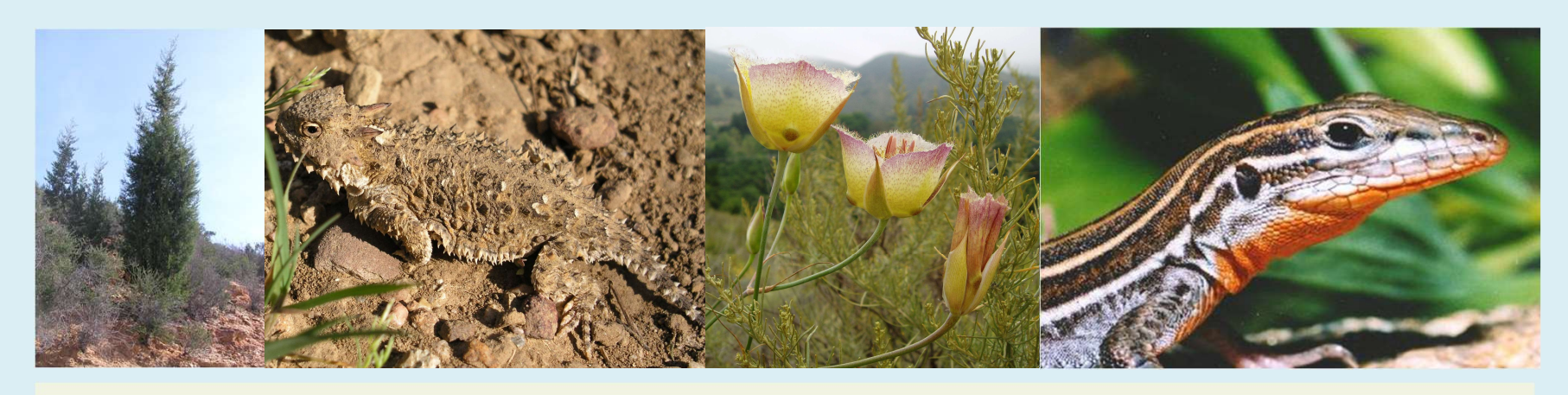
Tecate Cypress, Horned Lizards, Intermediate Mariposa Lilies, and Orange-Throated Whiptail Lizards are all species with conservation and management protections in the NCCP/HCP