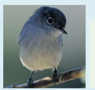
Coastal California Gnatcatchers are federally-listed as threatened and are targeted for protection in the NCCP/HCP