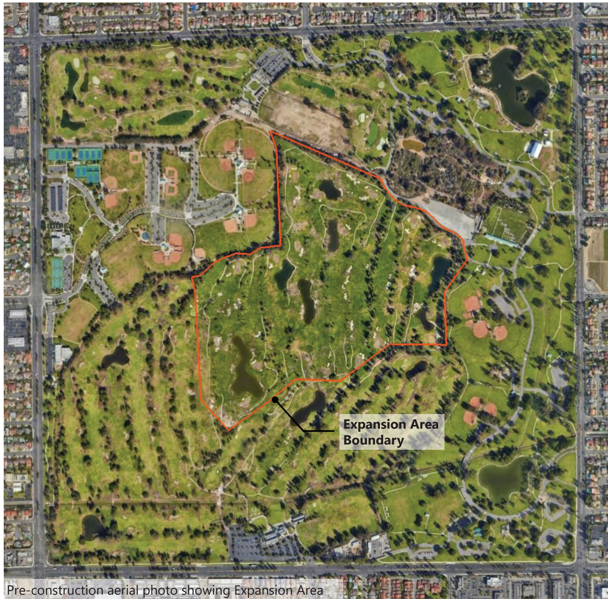
Pre-construction aerial photo showing Expansion Area