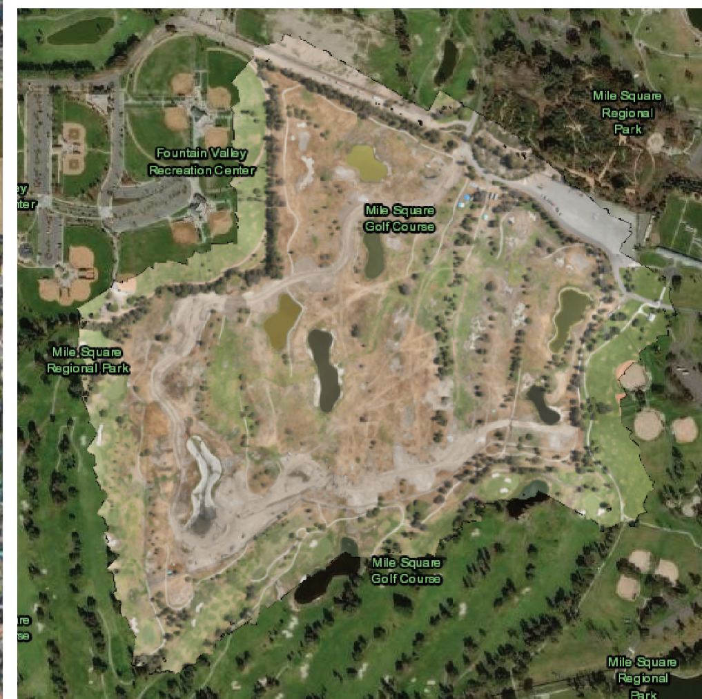
Aerial photo of construction progress in Expansion Area, June 2022