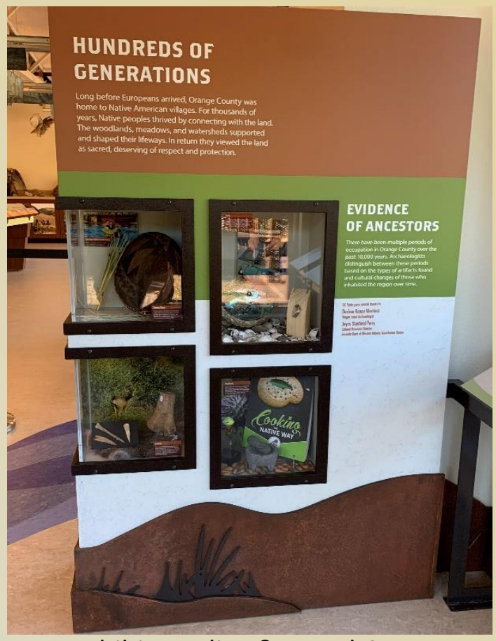
New exhibit at Aliso & Wood Canyons Wilderness Park