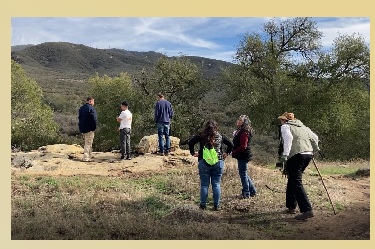
Visit with native people at Black Star Canyon