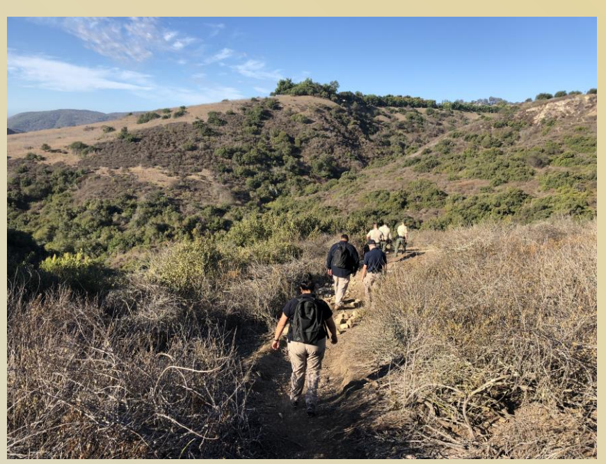
Unauthorized trail survey at Aliso & Wood Canyons Wilderness Park, September 2021