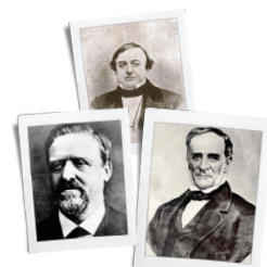
Pictured (from top): Juan Alvarado, James Irvine and Jose Sepulveda