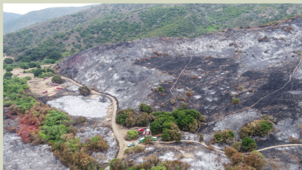
Aliso and Wood Canyons Wilderness Park, June 5, 2018

The blackened hillsides may appear lifeless; however, natural recovery is already underway. The ash contains rich nutrients that will aid habitat regeneration.