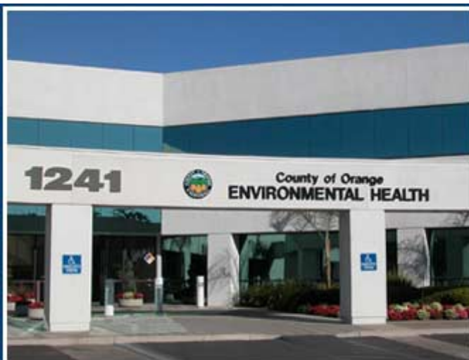
Environmental Health's new headquarters at 1241 East Dyer Road, Santa Ana, is large enough to accommodate all the employees and has plenty of parking spaces available for both staff and visitors.

The organization consists of 200 employees with various scientific, administrative and management backgrounds. The division is primarily fee supported. The Auditor-Controllers office provides staff to process the billing.